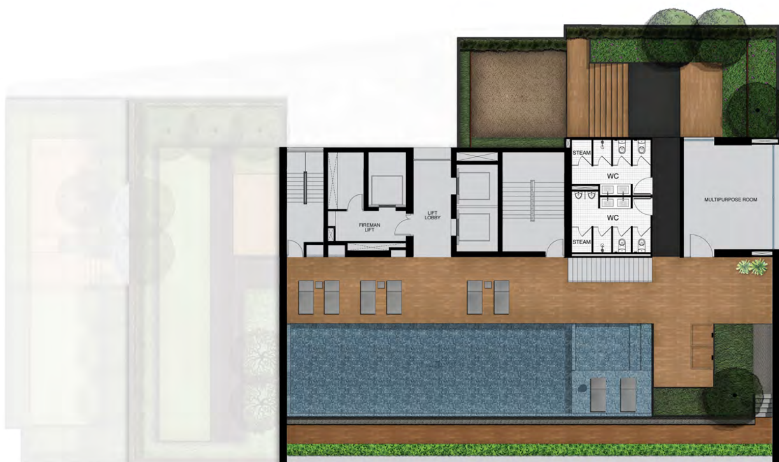
32 nd floor